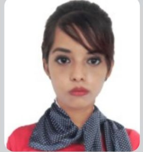
Simran Shaikh STATUE OF UNITY